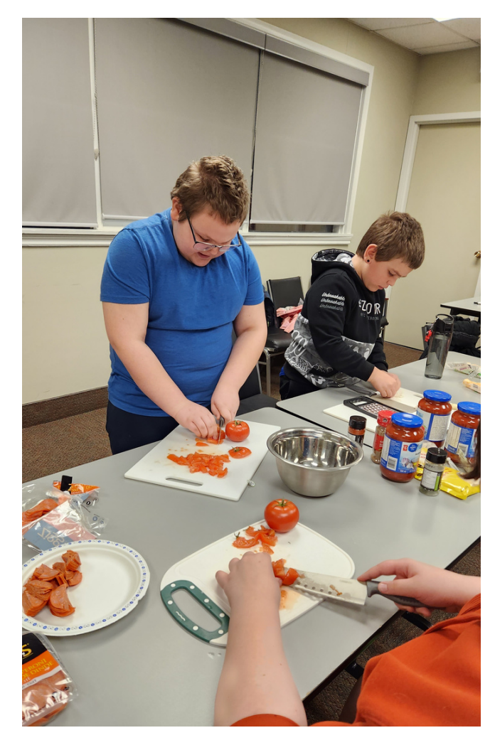
How can we help? What can we do?

This is where Young Caregivers Association comes in!